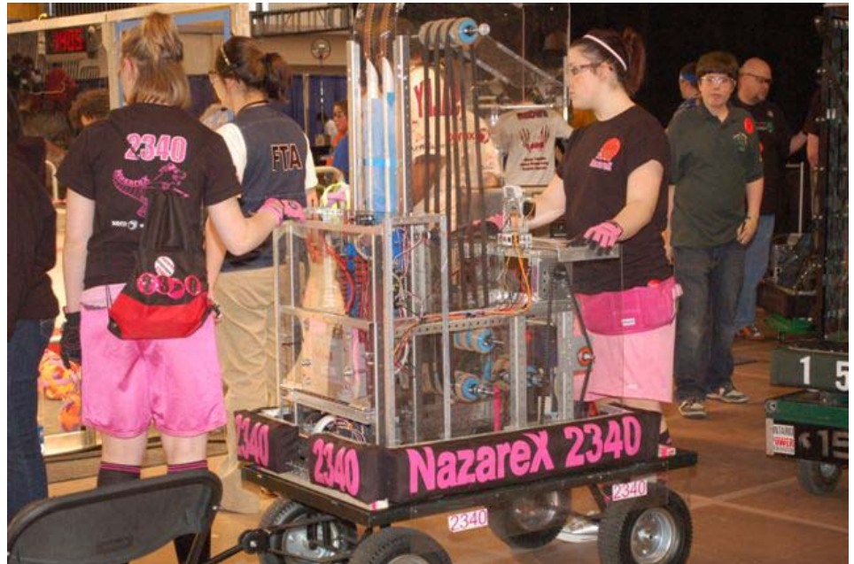
Nazareth Academy's Robotics Team with "Sally."

Robotics demands mathematics, teamwork, patience and engineering. Along with ingenuity and creativity, scholarships are a possibility due to involvement with such a beneficial experience.