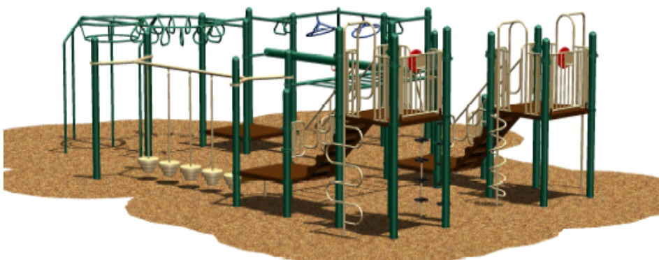
Rendering of Phase II proposed playground design by Universal Play Systems

Nicky Gilbert were on hand to test the equipment for fun factor. Through efforts by Maplewood's own Legislator, Steve Eckel, grant money is committed by State Senator Jim Alesi and NYS Assemblyman Joe Morelle for Phase II which will include more equipment for 5 to 12 year olds. Phase II installation will be in the Spring of 2008.